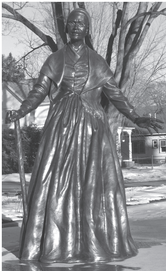
The Sojourner Truth Memorial Statue.

- Sag Harbor Express , 30 November 1905.