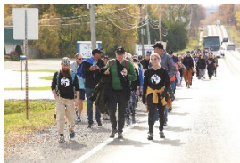
Abolition Walkers returning to Canastota from the 5.4 mile walk to Clockville and back to Canastota - retracing the steps of 104 abolitionists in 1835 to establish the New York State Antislavery Society.