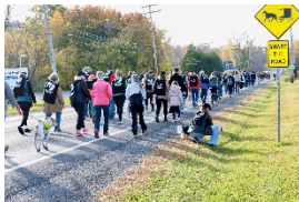
Abolition Walkers begin the route from Canastota to Clockville to retrace the steps of 104 abolitionists in 1835 to establish the New York State Antislavery Society.